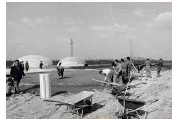
Mushroom field, cantiere sperimentale a San Cesario sul Panaro (Modena) 1966/1967

This paper presents a compendium of the studies conducted as part of the research work of the Construction and Technology Area of the Academy of Architecture - USI into the material, constructional, conservational and restoration aspects of the first and best known of his experiments: the system for construction of thin-shell concrete domes using pneumatic membranes, known as "Binishells". The results concerning two pivotal moments of this experimentation will be illustrated, both declared assets of cultural interest and therefore subject to protection. These are the "Mushroom Field" (1966-1968) - the experimental construction site at San Cesario sul Panaro (Modena), where he developed his system - and the holiday home for Michelangelo Antonioni in Costa Paradiso in Sardinia (1971). This is perhaps Dante Bini's finest work, and embodies many aspects of the architectural debate in those times years. It is certainly the best known in the media, but also really the least known in its material properties. The research conducted on direct and indirect sources, including unpublished ones, has recently been enriched by the availability of the personal archive that Dante Bini donated to the Academy of Architecture.