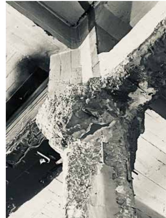
Un chapiteau de BOZAR en cours de travail à Bruxelles. Salle de Musique de chambre. (Photo d'avril 2023).