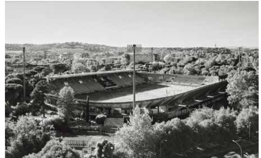
Stadio Flaminio

Both cases highlight the importance of methods based on a rigorously scientific approach, combining advanced analysis tools with conservation. They stimulate reflection on the potential of these tools protecting the modern architectural heritage in a European context, contributing to the debate on the criteria of authenticity, sustainability and compatibility of restoration projects.