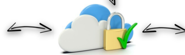
24/7 Secured Cloud Data Storage